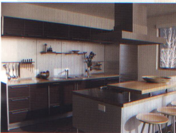
ASPEN ARCHITECTURAL PHOTOGRAPHY

"I love the river views. We sacrificed cabinet space for panoramic views of the Roaring Fork River. I enjoyed creating the backsplash—because it is glass, it is easy to clean—and I love the colors and the effect it creates with the reflections from the lights under the cabinets." —Amy Feldman